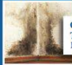
Toxic Black Mold Removal